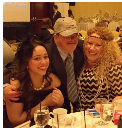
From last year's Gatsby Dinner Auction.