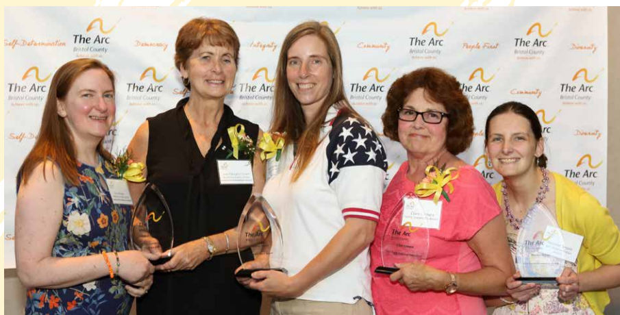
Pictured here 2016 Arc Annual Award Winners

Nominations must be received by May 1, 2017. Nomination forms are available at any Arc office, or you may complete an online form at www.arcnbc.org . If you have any questions, please contact (508) 226-1445 or info@arcnbc.org .